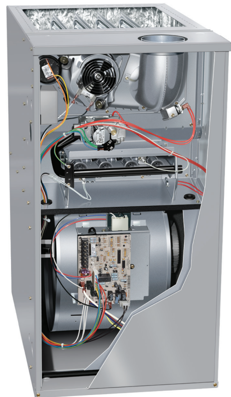
N80 Gas Furnace

* To the original owner, ACiQ products are covered by a 10-year parts limited warranty upon timely registration. The limited warranty period is 5 years if not registered within 90 days of installation except in jurisdictions where warranty benefits cannot be conditioned upon registration. See warranty certificate for complete details.